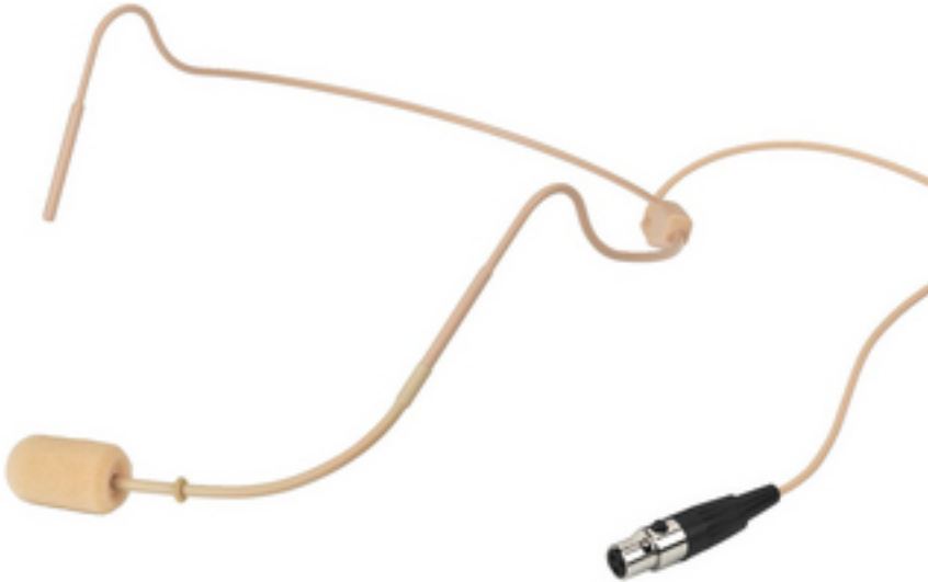
Umbau von 4-Pol-HSE-Kopfbügelmikrofonen zum Anschluss an JTS-Taschensender Reconfiguration of 4-pole HSE headband mics for the connection to JTS pocket transmitters