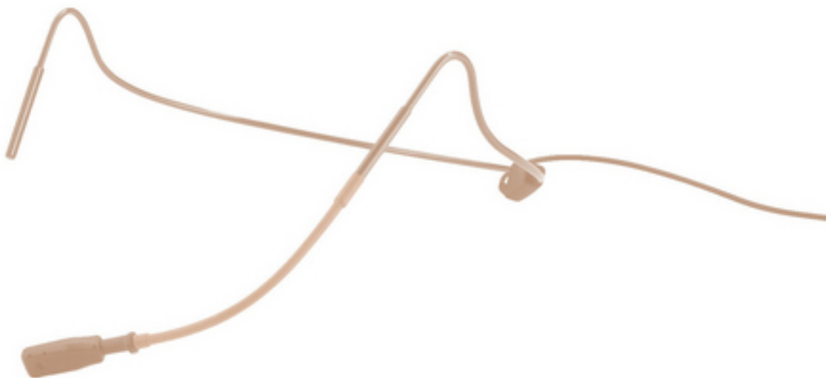
Umbau von 4-Pol-HSE-Kopfbügelmikrofonen zum Anschluss an JTS-Taschensender Reconfiguration of 4-pole HSE headband mics for the connection to JTS pocket transmitters